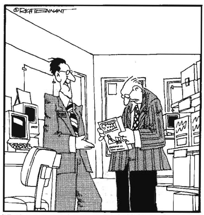
"IT'S A SOFTWARE PROGRAM THAT MORE FULLY REFLECTS AN ACTUAL SCHOOL ENVIRONMENT. IT MULTITASKS WITH OTHER USERS, INTEGRATES SHARED DATA, AND THEN USES THAT INFORMATION TO NETWORK VICIOUS RUMORS."

It will take us a while to find out how "no compromise" the Apple II emulation card is; the LC is not expected to be available in quantity until January 1991 and the Ile emulation card is not scheduled for release until March. The product information sheet for the card indicates that it can run at either 1 or 2 megahertz and will use up to 256K of the LC's memory as expanded Apple II memory. Both of